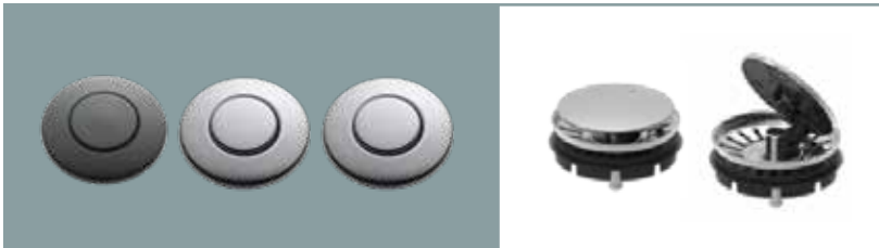
The air switch button is available in three colour choices.